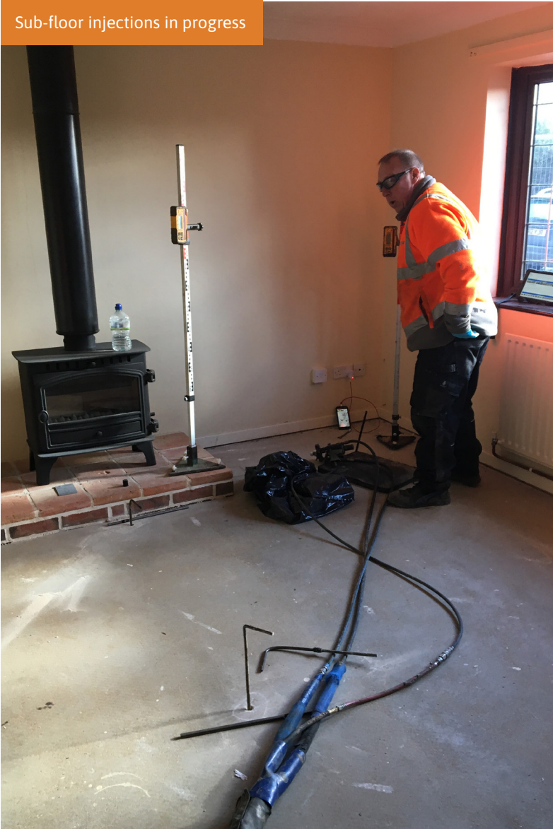
Sub-floor injections in progress